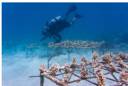
Coral Reef Restoration Project

The Luuk Nature Center also serves as a command center for sustainability activities promoted across the entire Resort. Tokyu Land collaborates with a variety of partners to invest in natural capital.