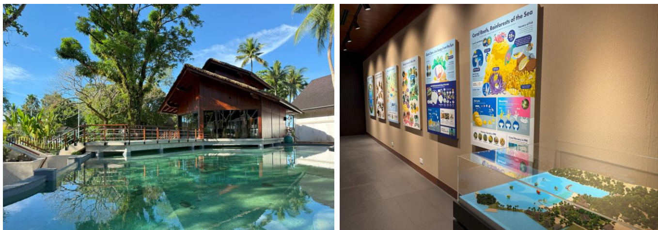
Luuk Nature Center