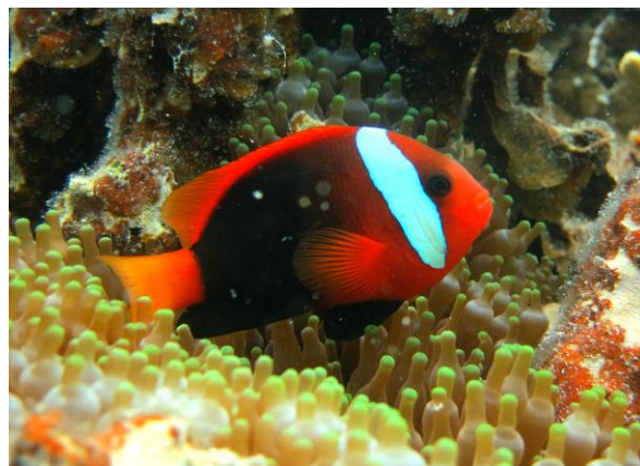
Image representation of Snorkeling Eco-tour