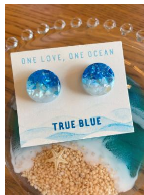
Image representation of Marine Debris Upcycling Workshop