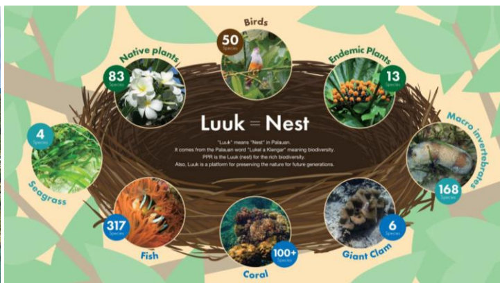
The rainforest and private beach that are the pride of the Resort and the ecosystem that thrives there