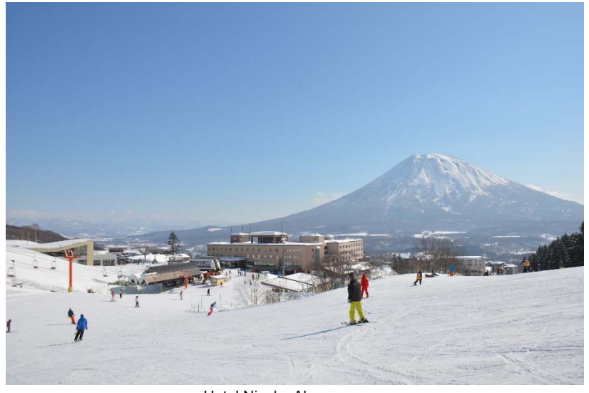
Hotel Niseko Alpen