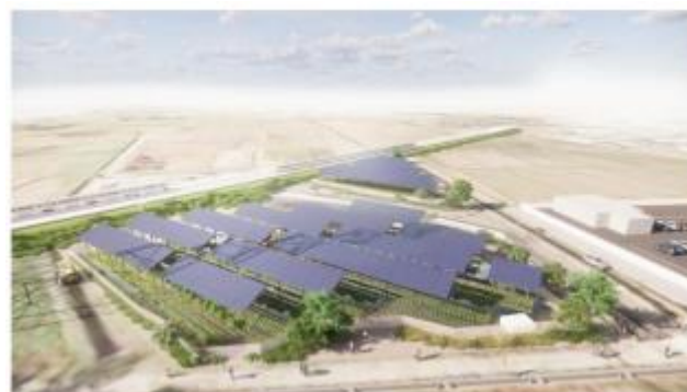
ReENE Solar Farm Higashi Matsuyama Panoramic view of solar power plant (artist's impression)