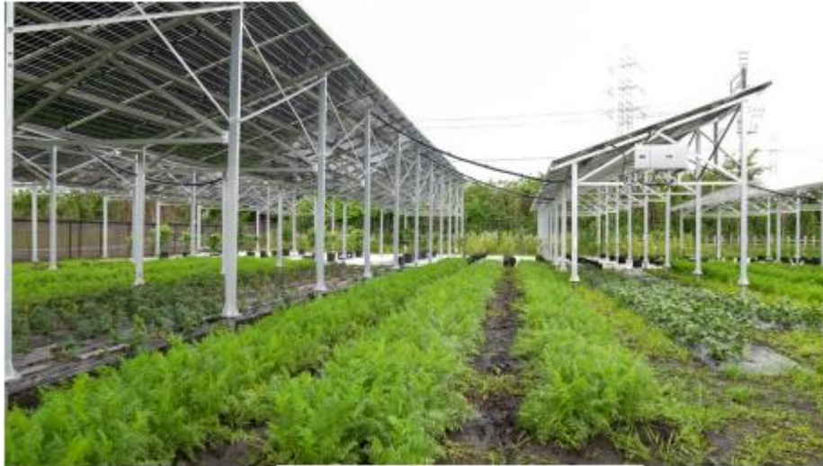
ReENE Solar Farm Higashi Matsuyama