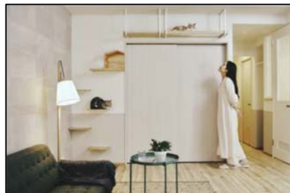
Residential units allowing cats (up to 3) to be kept