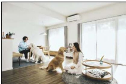
Residential units allowing large dogs to be kept