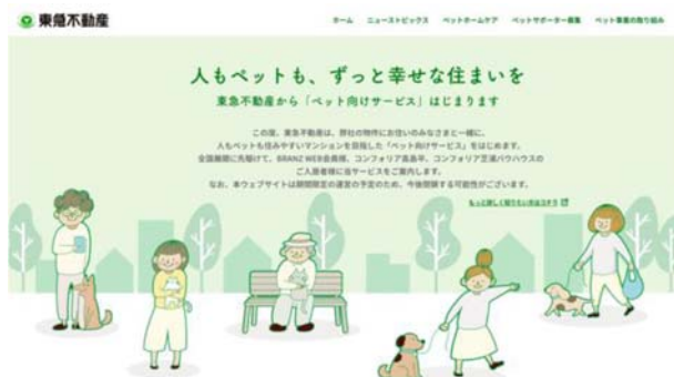
Residences where both people and their pets are always happy

For field trials for non-physical infrastructure services, pet food and other products and services that are necessary when residing with pets became available online for a limited time only exclusively for members of “BRANZ WEB,” a members-only organization for customers that have entered a lease for a new condominium with Tokyu Land. With competition in the pet industry intensifying, through cooperation with pet service providers that are supported by customers who love their pets, services with a high degree of customer satisfaction will be offered.