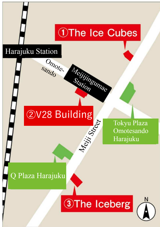
<Meijijingumae Station and surrounding area>