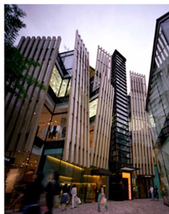
The Jewels of Aoyama